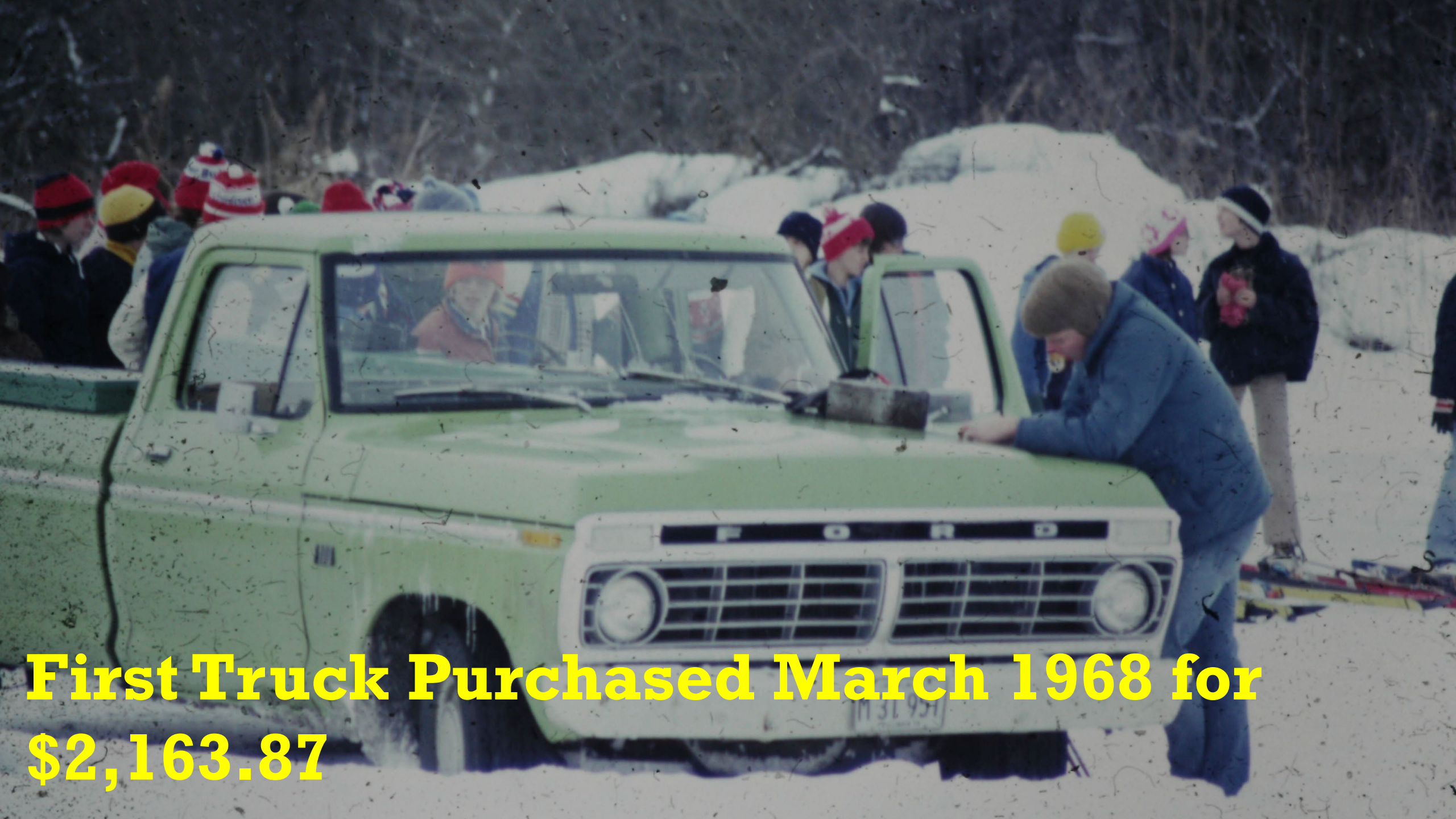
First Truck Purchased March 1968 for $2,163.87